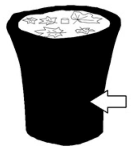
FT-258B (79 lbs) 18"L x 16.5"W x 18"H

Assemble your fountain on a level surface capable of holding a minimum of 110 pounds with an approximate 0.75 square foot footprint.